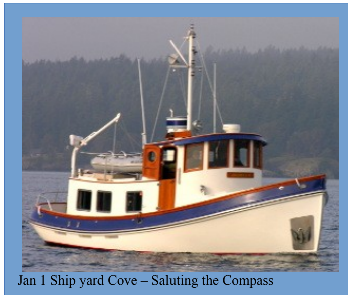
Jan 1 Ship yard Cove – Saluting the Compass

The electronic aids we have today on Polaris do make traveling in the fog or in the dark much easier than my years of crewing on Finale but over the years I have lost all interest in taking on the water beyond of the Strait of Juan de Fuca in a boat with only a 23' waterline. I think I will limit my possible cruising destinations for the upcoming season in mostly protected waters.