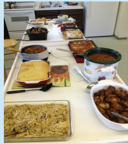
Our monthly feast!