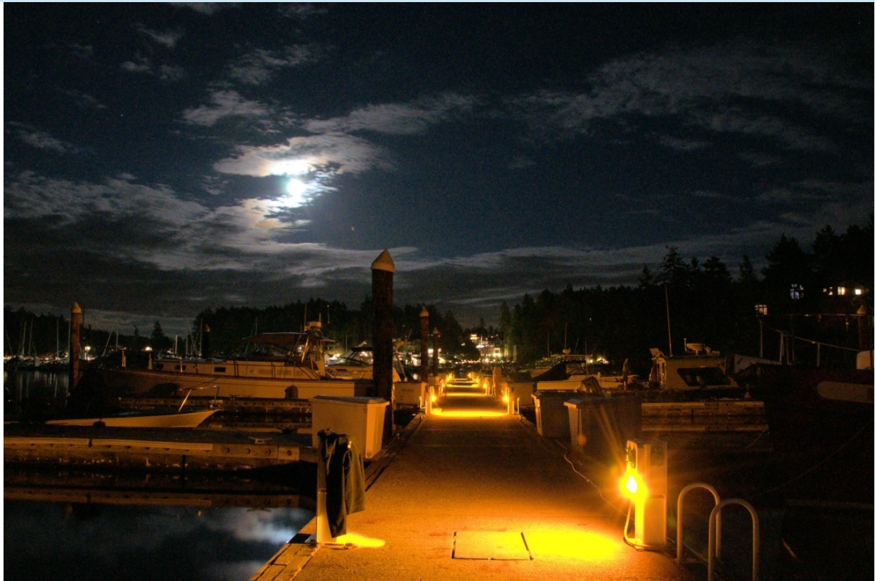
Full moon over Roche Harbor