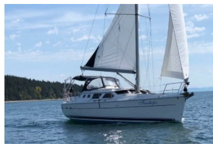
Fairhope under sail