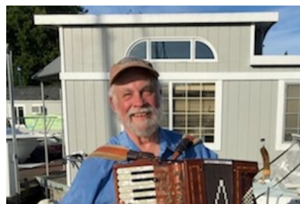
Sea Shanties on the dock at Paulsbo