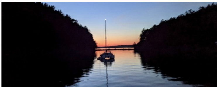
On anchor, Aug. 2021 – Cypress Island

https://www.fridayhARBORSAILING.com/calendar/calendar-cruises/ There you can sign up, see the list of members that have already signed up and see some information about the cruise. This information will be updated as cruises become closer in time.