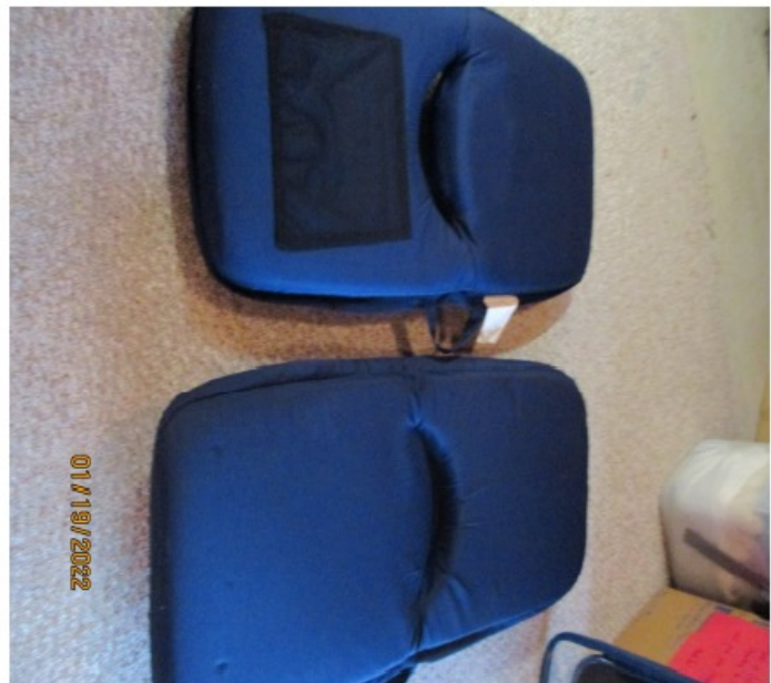
Front and Back views in open (for storage, carrying) position