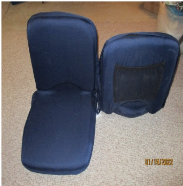
Front and Back views in sitting position