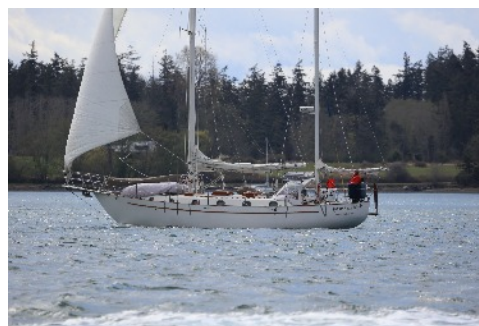
SV Salmon & Sandy II sailing to Rosario