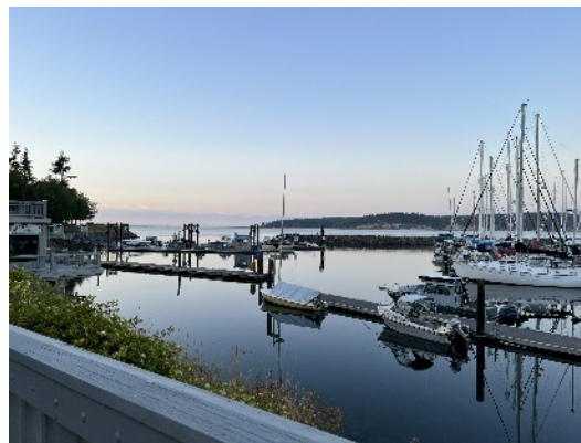
John Wayne Marina in Sequim