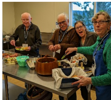
Dinner is served in the Grange "Galley"