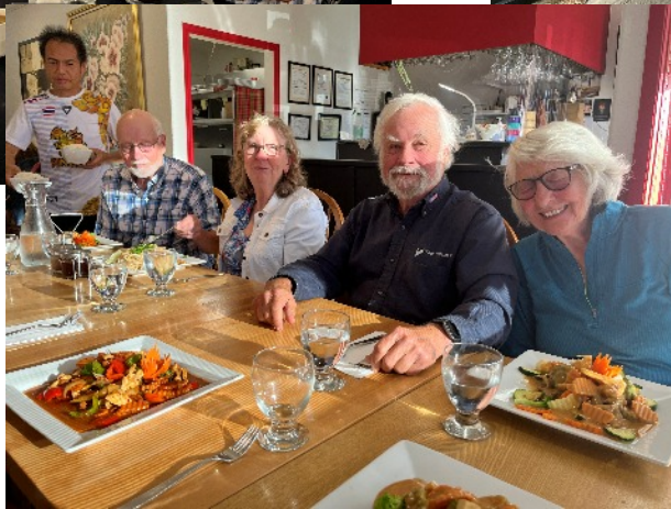
Highlights of this cruise includes meals together