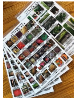
Our trusty field guides