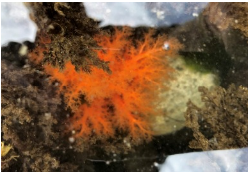
The frilly tentacles of a Red Sea Cucumber whose main body is hiding under a rock

After a full day of hiking and ‘pooling, we once again met at the group shelter for a putluck – and more libations – to celebrate a very special day at a very special place. Tales of intertidal tribulations, and invertebrate investigations were told around the campfire (properly enclosed within the park provided fire ring structure). Sunday it was time to travel home, with a gentle breeze to fill our sails and a favorable current to speed us along. We all were warmed by a sense of camaraderie and discovery in the watery world of the intertidal.