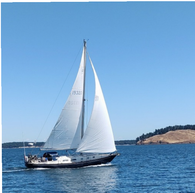
SV Alethea finally catching up to the SV Fairhope on the race from Sidney to Friday Harbor July 2023