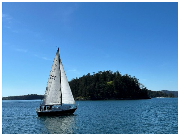
A gentle breeze for the ride home from the Deer